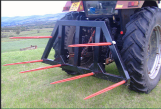
Double Bale Spike

This linkage spike is manufactured with a heavier frame, tines & bushings to suit higher horse powered tractors.