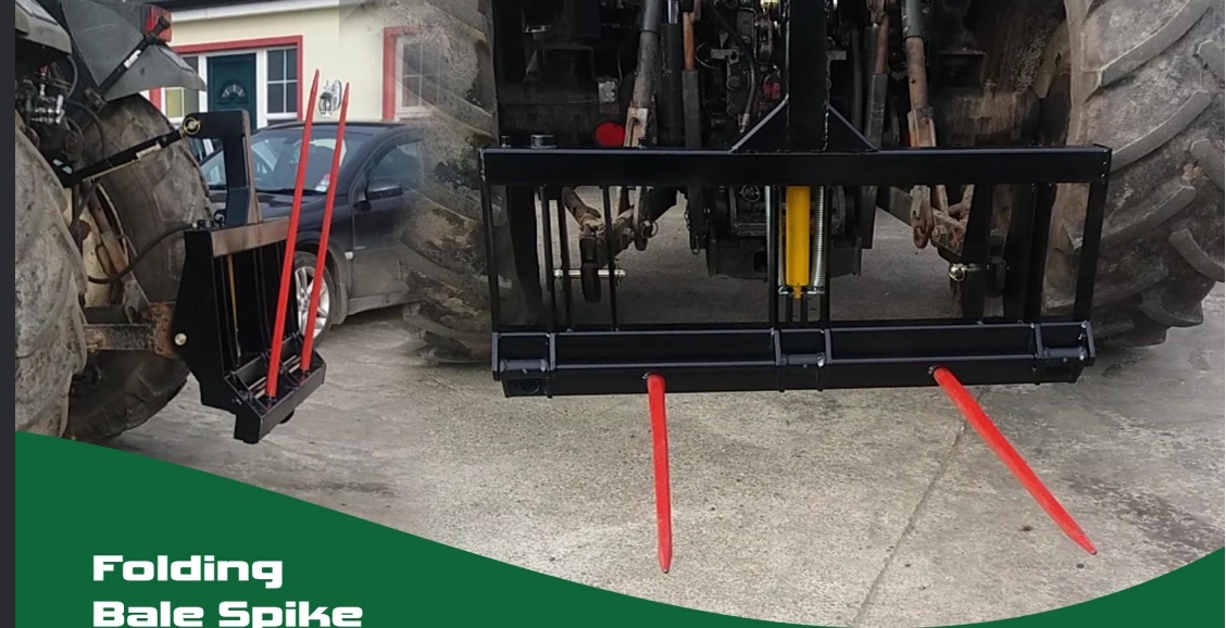
Folding Bale Spike

The Folding Bale Spike is designed to be safe for road transport with its hydraulic ram which raises the spikes to a vertical position.