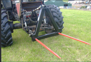
Single Bale Spike

This spike has two standard 1100mm long sized spikes manufactured from 80x80x5mm box iron to allow maximum strength when carrying a bale.