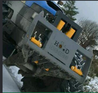
PIN & CONE