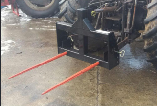
H/D Linkage Spike

This spike has two standard 1100mm long sized spikes manufactured from 80x80x5mm box iron to allow maximum strength when carrying a bale.